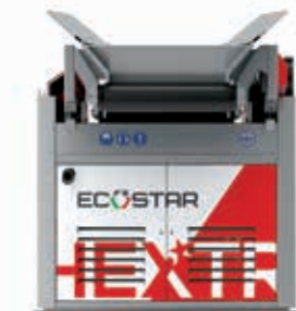
Hextra hooklift version