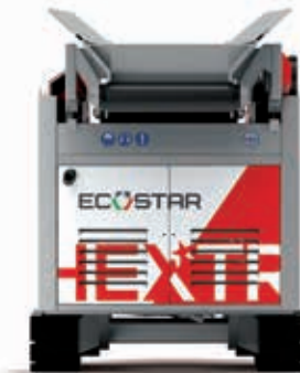
Hextra track version